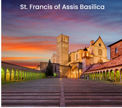
St. Francis of Assisi Basilica