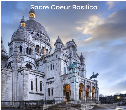
Sacre Coeur Basilica